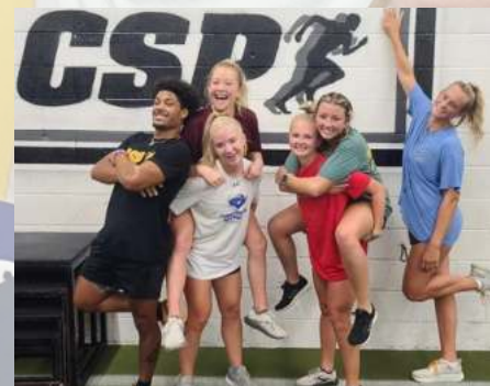
Cover photos courtesy of the following FY2023 MAERDAF grantees - Delmarva Chicken Association, 100 Years of Delmarva Chicken project, Garrett College, Culinary Program Build Out, LEAD Maryland, Class XII Seminar, Off Street Performance, Youth Empowerment program.