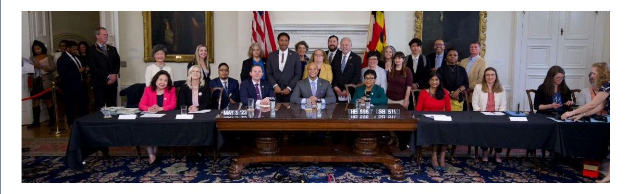
Photo: House Bill 596/Senate Bill 511 signing at the Maryland State House on Wednesday, May 3, 2023, for the approval of the Health and Human Services Transportation Improvement Act of 2023.