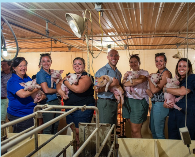
LEAD Maryland