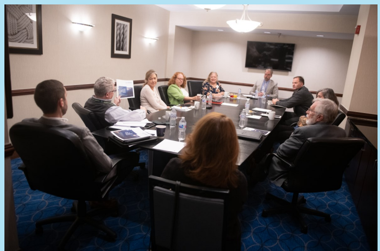
Rural Maryland Foundation Board during the 2021 Rural Summit