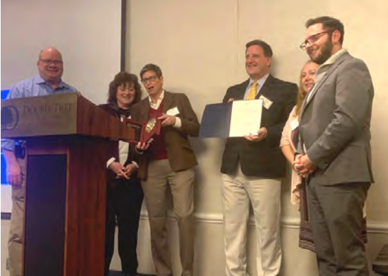
Cecil County Economic Development Team accepting Rural Economic Development Award.

Rural Economic Development Award to Cecil County Economic Development . The Cecil County Economic Development (OED), located in Elkton, MD, is a government agency that promotes business activity and development in the Cecil County area. The OED holds monthly Towns-County Meetings where the towns and the OED come together to discuss projects, issues and initiatives happening across the county. This relationship has helped not only the municipalities connect with each other and support efforts occurring in other parts of the county, but it has also allowed the OED to help with growth in towns and assist them in reaching their objectives. The OED has played a crucial role in the County's economic transformation, which includes the County ranking #2 for job growth in the State (1,352 new jobs in Cecil County in 2019 alone) along with the 3rd highest 1-year wage growth rate of all Maryland counties. Future projects in the Great Wolf Lodge in the Town of Perryville and hosting a Five-Star equestrian event at Fair Hill.