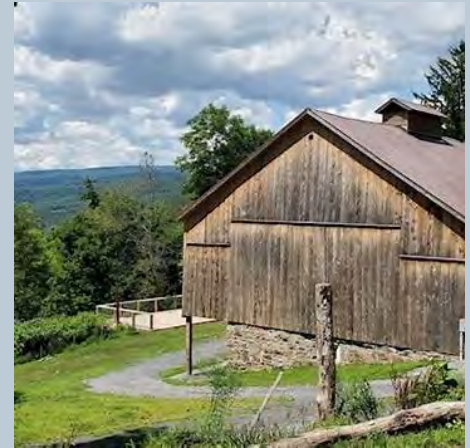
The barn at Evergreen Heritage Center used for events on the upper floor and a living history museum on the lower floor.

Rural Community Development Award to Evergreen Heritage Center Foundation . The Evergreen Heritage Center (EHC), a historic 130 acre Maryland farm, is located in rural Allegany County. The EHC Foundation, a 501(c)(3) public charity, was founded in 2008 to leverage the EHC to empower the region's children (in Allegany, Washington, and Garrett counties) through experiential education programs that are aligned with the Maryland State Curriculum. To pursue this mission, the EHC Foundation partnered with members of the academic, business, and public service sectors to develop both impactful education programs and Center infrastructure that would support those programs as well as other needs of the community.