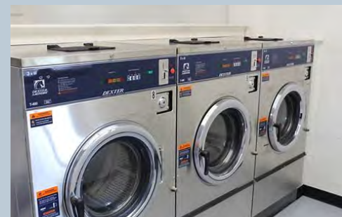
Photo Below: Industrial laundry equipment purchased with RMC Grant Funds.