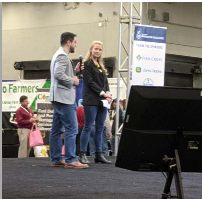
Hivelend, graduates of the F 3 Tech Accelerator program, presenting at the The Agriculture Innovation Challenge held during The Farm Bureau Federation's 2020 National Convention, Austin TX.

RMPIF promotes entrepreneurship and assists efforts that provide training and technical assistance to the entrepreneurs who can help build prosperous and sustainable rural communities by creating jobs, raising incomes, creating wealth and improving the quality of life.