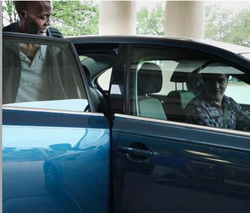
Transportation to Wellness Pilot Project Clinic

RMPIF prioritizes the following areas: Access to health and medical/dental care; Recruitment and retentions of health care providers; Behavioral mental health; Programs that implement and measure components of the Maryland Rural Health Plan; Chronic disease prevention and management; Oral and Dental health.