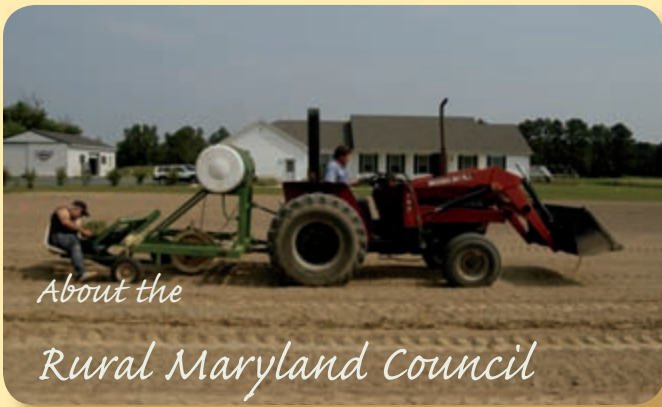
About the Rural Maryland Council

The Rural Maryland Council, an independent state agency, brings together rural leaders, government officials at all levels, and representatives of the non-profit and for-profit sectors to develop public policy solutions to the challenges unique to rural Maryland. Ultimately, our mission is to improve the quality of life while preserving the pastoral heritage of Maryland's rural communities.