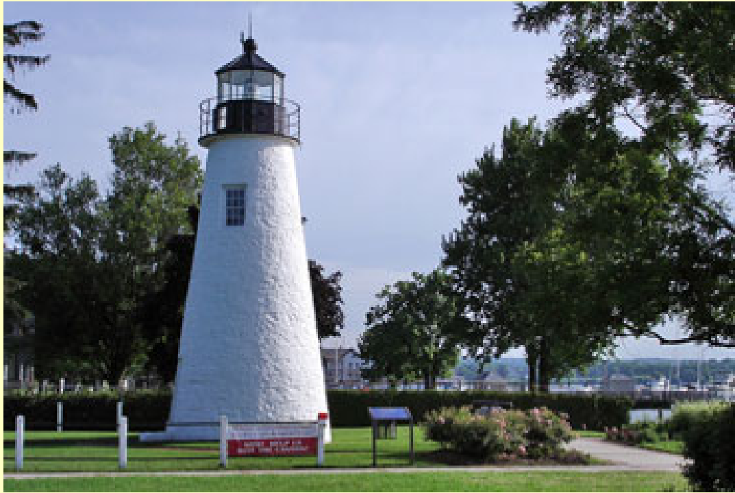
Photo: Concord Point Lighthouse in Havre de Grace, Maryland.