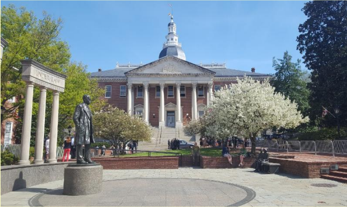
Maryland State House