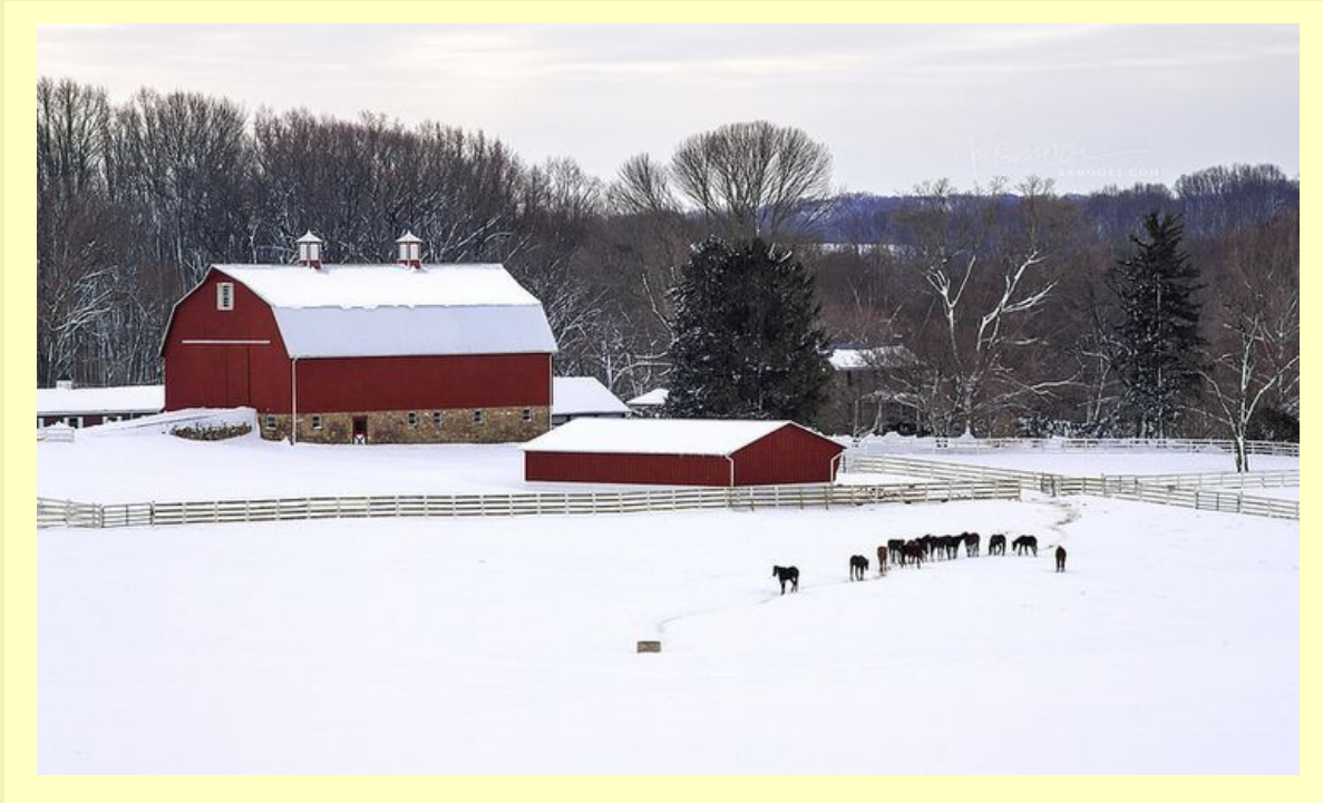
Farm in Harford County, Maryland.