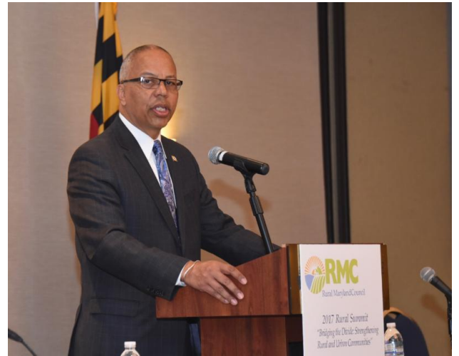
Lt. Governor Boyd Rutherford speaking at RMC Rural Summit held at the Double Tree Hotel in Annapolis, Maryland.

We also held great Secretary and Legislative Panels. Our featured Legislative panel guest speaker was Brian Frosh the Attorney General of the State of Maryland. View recordings, PowerPoint presentations and our evaluation survey for the event here .