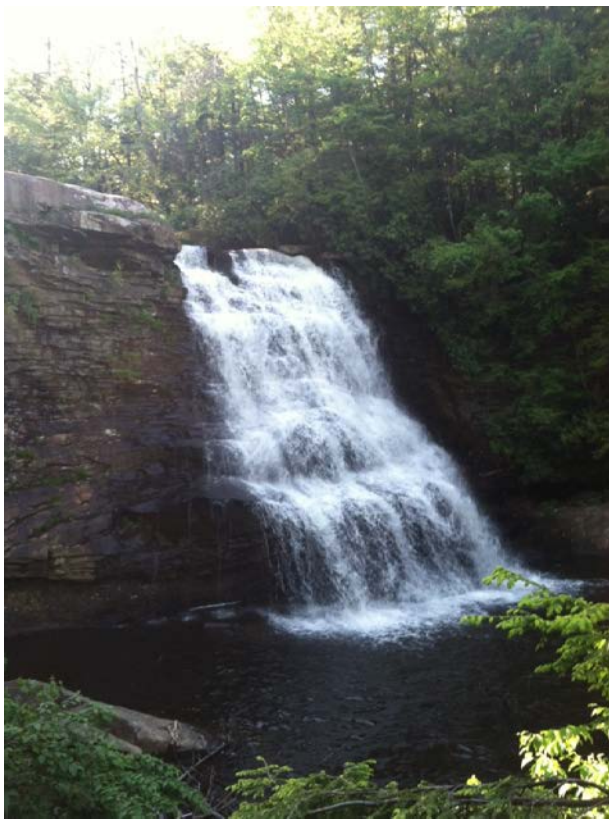
Muddy Creek, Swallow Falls State Park, Garrett County

As a member of the National Rural Development Partnership, the RMC once had a formal partnership with USDA, which included an approved work plan and a corresponding federal appropriation, with a state match. No formal partnership with USDA has existed since 2005 when federal priorities shifted; however, the State of Maryland has, to date, continued to support the RMC – its State Rural Development Council. The Partners for Rural America (PRA) , a national nonprofit which represents SRDCs, has been working with USDA to re-establish that relationship. The RMC's Executive Director is a member of the PRA Board.