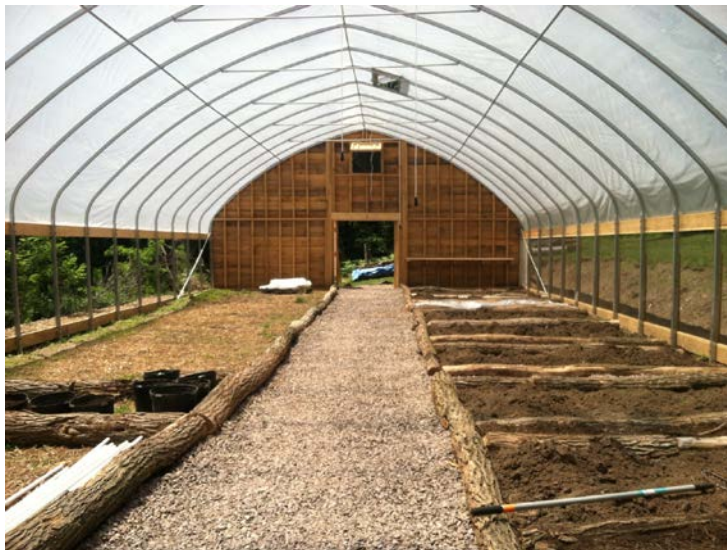
Heritage Hoop House funded through a FY 2013 MAERDAF Grant to Evergreen Heritage Foundation, Mt. Savage, Maryland

Established in 2000, the Maryland Agricultural Education and Rural Development Assistant Fund (MAERDAF) offers important financial support to rural-serving nonprofit organizations that promote statewide and regional planning, economic and community development, and agricultural and forestry education efforts. The Fund also provides targeted financial assistance to community colleges that support small and agricultural businesses through enhanced training and technical assistance offerings.