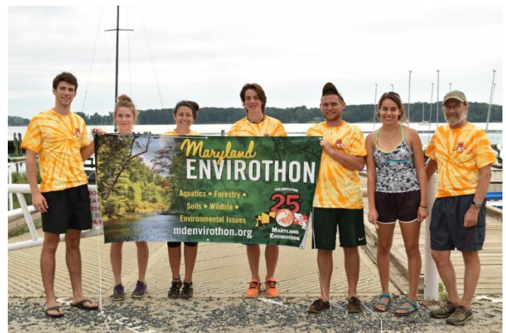
2016 Maryland Envirothon

The Maryland Envirothon is a series of environmental competitions that allows teams of students to move beyond the classroom in order to solve real-life environmental problems in a natural setting. For FY 2016, MASCD utilized MAERDAF grant funding for the execution of county and State Envirothon competitions, including funding for administrative staff support and facility rental. In 2016, 20 of 23 counties held an Envirothon event, and over 1,100 students participated statewide in the Envirothon.