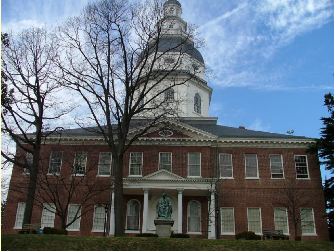
Maryland State House